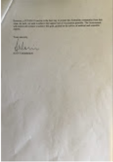
Scott Morrison Covid Vax 2.jpg 952K